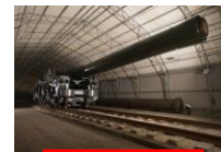
Railway Gun Dome